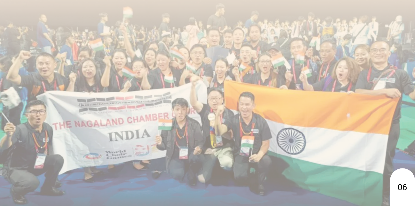
2023 김룡 세계합창대회 시상식 The 12 th World Choir Games – Gwangju 2023 Awards Ceremony